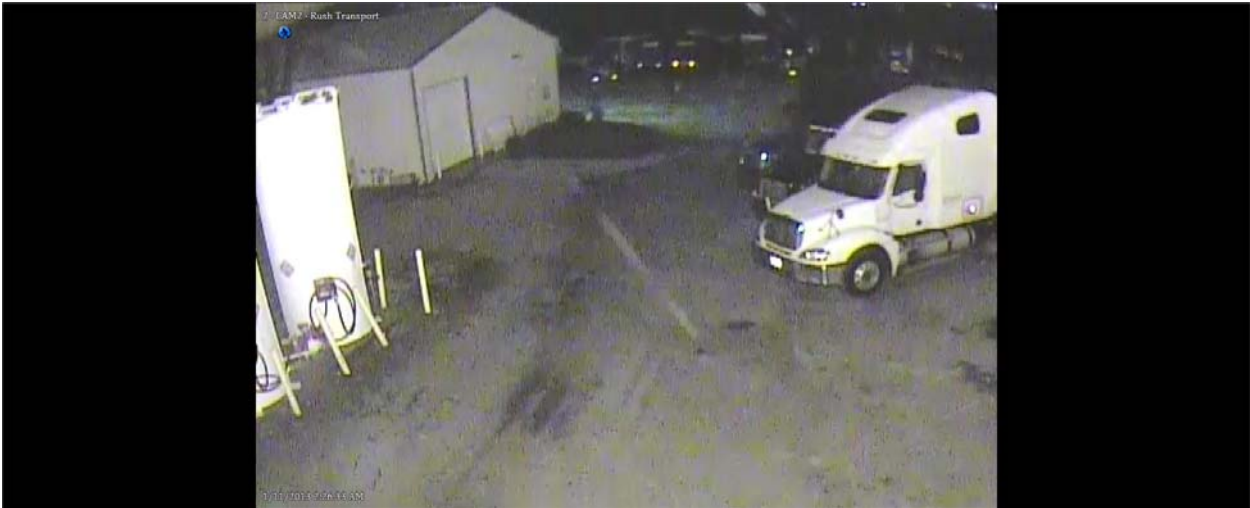
Traditional D/N Camera Color Day & B/W Night